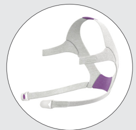
AirFit F20 for Her headgear with headgear clips 63473 (S)