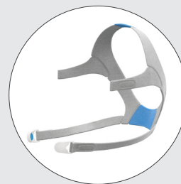
AirFit F20 headgear with headgear clips 63470 (S) 63471 (Std) 63472 (L)