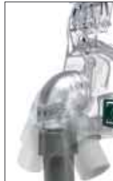
360° elbow rotation lets you choose the most convenient tube position